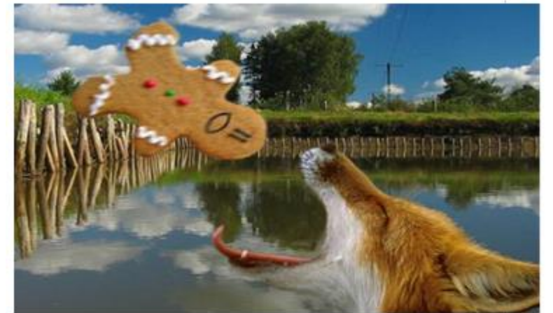
The Gingerbread Man's final moments, captured by a nearby duck.