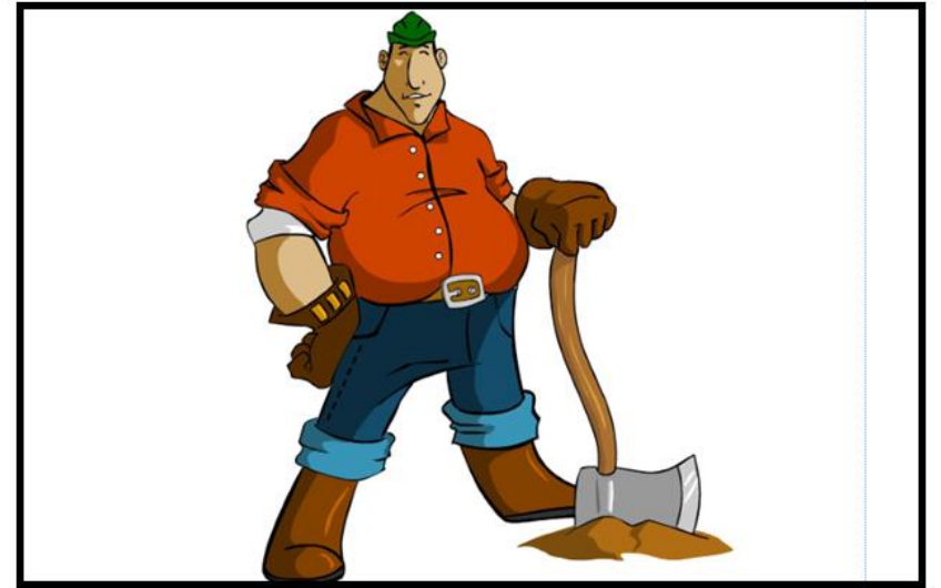
The hero of the day - Will the Woodcutter