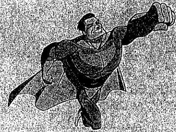
fiction – fictitious

When the root word ends in -ce , the ce is dropped and -cious is added.